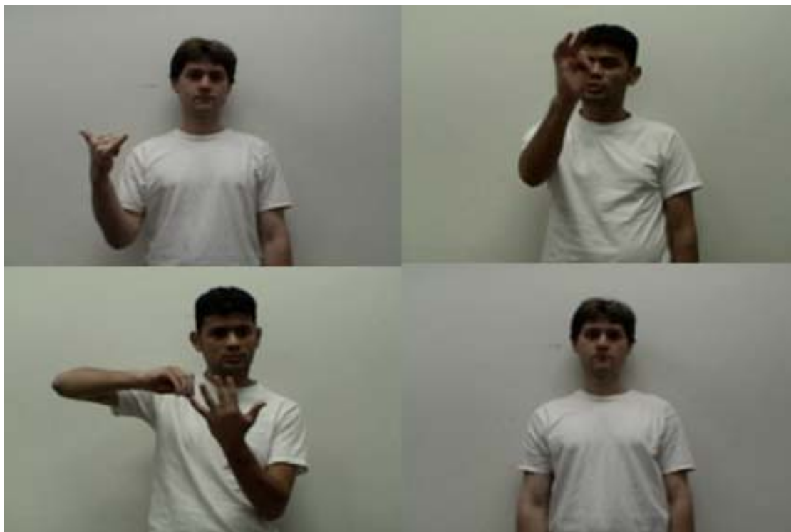
Figure 1. Examples of experimental stimuli. A) Euro-American actor performs the classic American 'hang loose' gesture. B) Nicaraguan actor performs a typical Nicaraguan gesture 'I swear (promise)' and C) one of the control gestures modified from the ASL sign for 'berries'. D) Euro-American actor in the 'static' condition.

Based on the above evidence of the influence of the observer's own motor repertoire on action perception, we hypothesized that a shared motor repertoire leads to more effective communication. Thus, we predicted that our Euro-American participants would